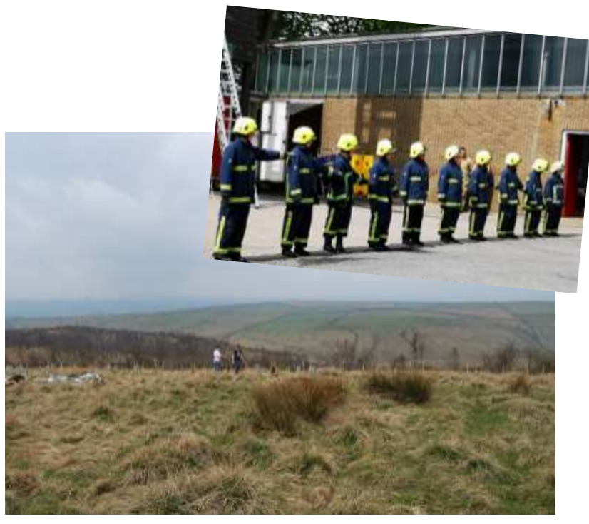
Teacher of Science January 2024

Settle College is a vibrant and exciting community of learners, forward thinking and driven for a small rural secondary school, that is an integral part of the community. There is a strong commitment from our staff to the College's wider role within the community and we always aim to get fully involved in community activities. From local church events like Armistice Day, working with local charities and businesses like the Millennium Trust to the Settle Flowerpot Festival, we immerse our students in their local environment.