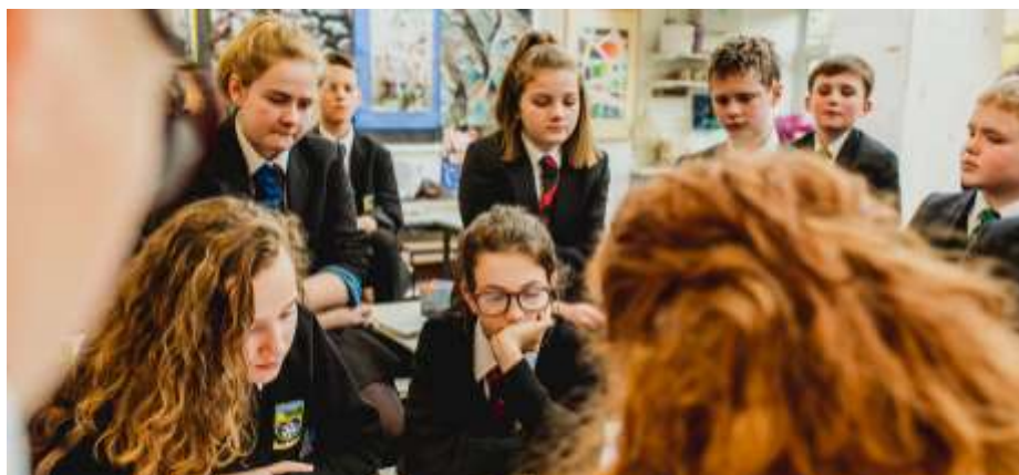
Full time teacher of Maths, Settle College 1.9.23

No performance measures are to be published by the DfE for 2020 or 2021, so the results displayed here are from 2019 and then 2022.